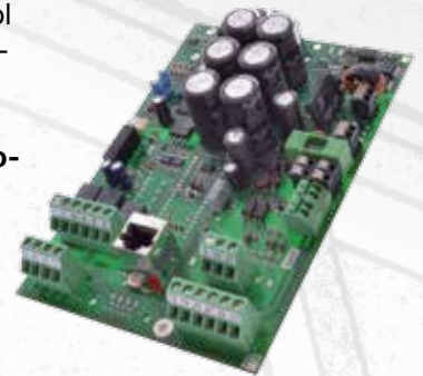
Compact, corrosion-resistant, robust and lightweight through high-quality aluminum alloys